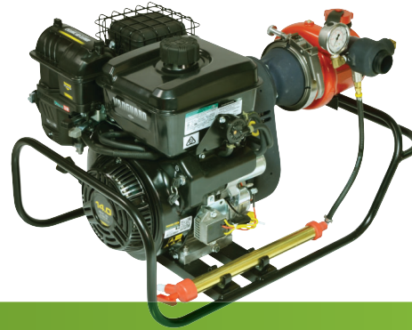
OPTIONAL FOUR STAGE PUMP END